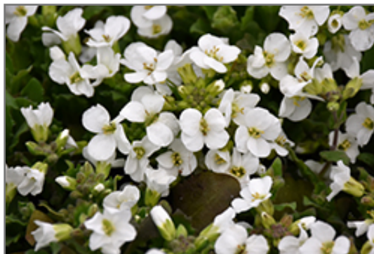
Snowcap Wall Cress flowers