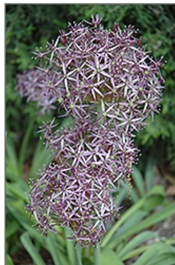
Star Of Persia Onion flowers