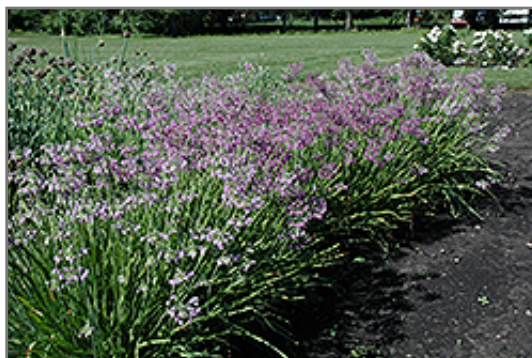
Nodding Onion in bloom