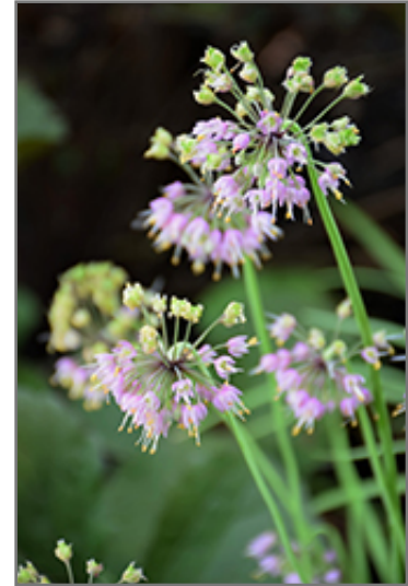
Nodding Onion flowers

This plant should only be grown in full sunlight. It does best in average to evenly moist conditions, but will not tolerate standing water. It is not particular as to soil type or pH, and is able to handle environmental salt. It is highly tolerant of urban pollution and will even thrive in inner city environments. This species is native to parts of North America. It can be propagated by multiplication of the underground bulbs.