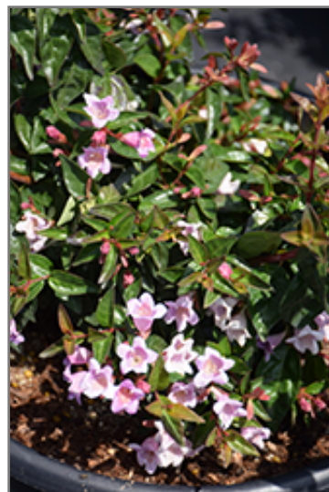
Sunrise Abelia flowers

Sunrise Abelia makes a fine choice for the outdoor landscape, but it is also well-suited for use in outdoor pots and containers. Because of its height, it is often used as a 'thriller' in the 'spiller-thriller-filler' container combination; plant it near the center of the pot, surrounded by smaller plants and those that spill over the edges. It is even sizeable enough that it can be grown alone in a suitable container. Note that when grown in a container, it may not perform exactly as indicated on the tag - this is to be expected. Also note that when growing plants in outdoor containers and baskets, they may require more frequent waterings than they would in the yard or garden. Be aware that in our climate, this plant may be too tender to survive the winter if left outdoors in a container. Contact our experts for more information on how to protect it over the winter months.