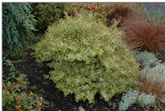
Sunrise Abelia

Sunrise Abelia is recommended for the following landscape applications;