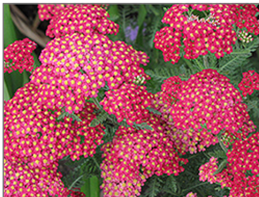
Galaxy Paprika Yarrow flowers

Galaxy Paprika Yarrow is recommended for the following landscape applications;