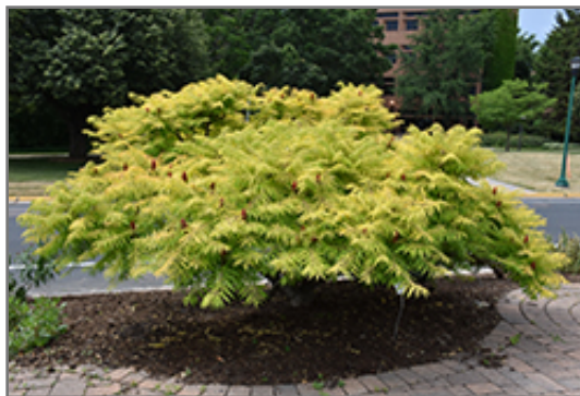
Tiger Eyes Sumac