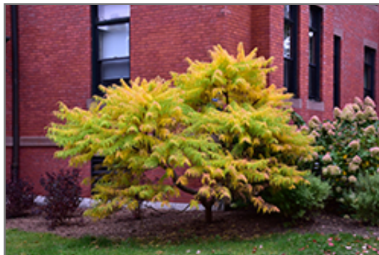
Tiger Eyes Sumac in fall