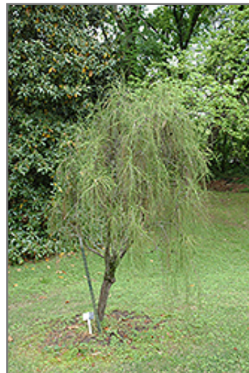
Threadleaf Arborvitae