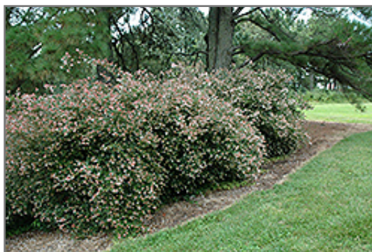
Glossy Abelia in bloom