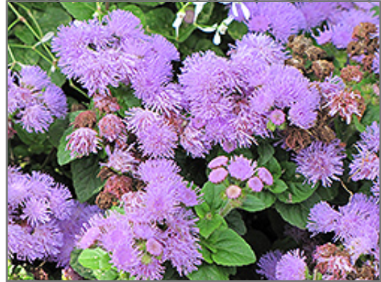
Artist Alto Blue Flossflower flowers