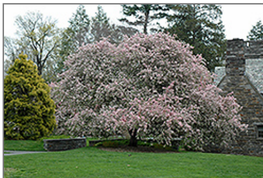
Japanese Flowering Crab in bloom

Japanese Flowering Crab will grow to be about 25 feet tall at maturity, with a spread of 30 feet. It has a low canopy with a typical clearance of 3 feet from the ground, and is suitable for planting under power lines. It grows at a medium rate, and under ideal conditions can be expected to live for 50 years or more.