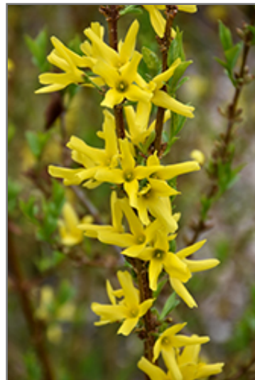
Bronx Forsythia flowers