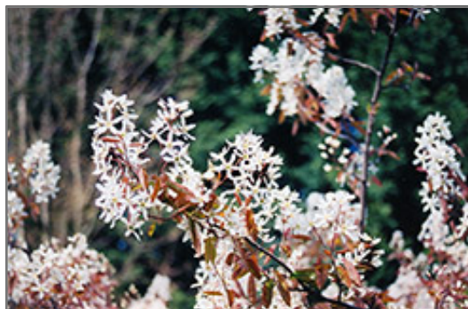
Cole's Select Serviceberry flowers

Cole's Select Serviceberry will grow to be about 15 feet tall at maturity, with a spread of 15 feet. It has a low canopy with a typical clearance of 3 feet from the ground, and is suitable for planting under power lines. It grows at a medium rate, and under ideal conditions can be expected to live for 40 years or more.