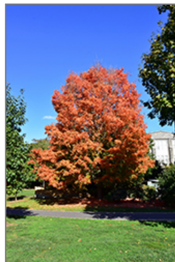
Bonfire Sugar Maple in fall