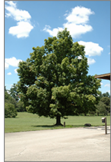
Bonfire Sugar Maple

This tree should only be grown in full sunlight. It prefers to grow in average to moist conditions, and shouldn't be allowed to dry out. It is not particular as to soil pH, but grows best in rich soils. It is somewhat tolerant of urban pollution. This is a selection of a native North American species.