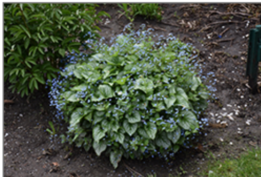
Sea Heart Bugloss in bloom

Sea Heart Bugloss is a fine choice for the garden, but it is also a good selection for planting in outdoor pots and containers. It is often used as a 'filler' in the 'spiller-thriller-filler' container combination, providing a mass of flowers and foliage against which the thriller plants stand out. Note that when growing plants in outdoor containers and baskets, they may require more frequent waterings than they would in the yard or garden.