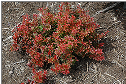
Lutin Rouge Japanese Barberry