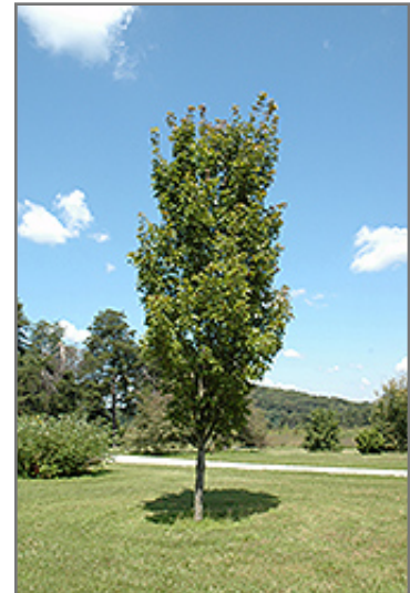
Red Rocket Red Maple

This tree should only be grown in full sunlight. It is quite adaptable, preferring to grow in average to wet conditions, and will even tolerate some standing water. It is not particular as to soil type, but has a definite preference for acidic soils, and is subject to chlorosis (yellowing) of the foliage in alkaline soils. It is somewhat tolerant of urban pollution. This is a selection of a native North American species.