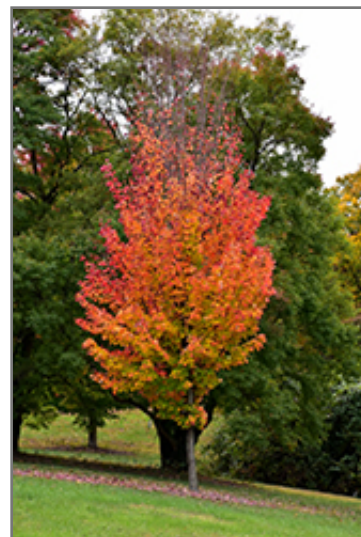
Red Rocket Red Maple in fall

Red Rocket Red Maple is recommended for the following landscape applications;