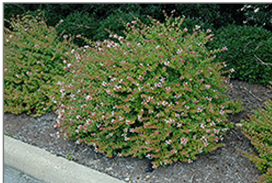
Rose Creek Abelia in bloom

Rose Creek Abelia is recommended for the following landscape applications;