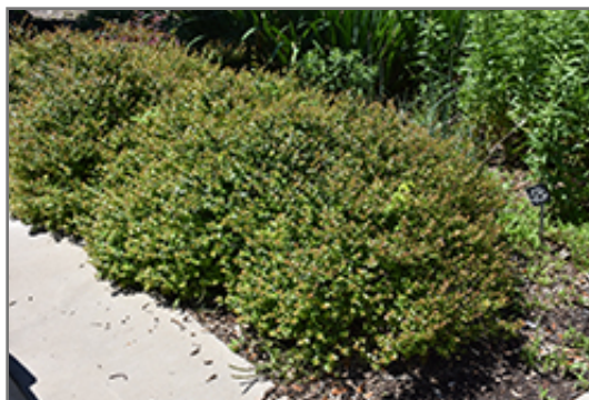
Rose Creek Abelia

Rose Creek Abelia makes a fine choice for the outdoor landscape, but it is also well-suited for use in outdoor pots and containers. Because of its height, it is often used as a 'thriller' in the 'spiller-thriller-filler' container combination; plant it near the center of the pot, surrounded by smaller plants and those that spill over the edges. It is even sizeable enough that it can be grown alone in a suitable container. Note that when grown in a container, it may not perform exactly as indicated on the tag - this is to be expected. Also note that when growing plants in outdoor containers and baskets, they may require more frequent waterings than they would in the yard or garden. Be aware that in our climate, this plant may be too tender to survive the winter if left outdoors in a container. Contact our experts for more information on how to protect it over the winter months.