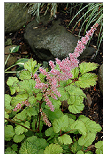
Amber Moon Chinese Astilbe flowers