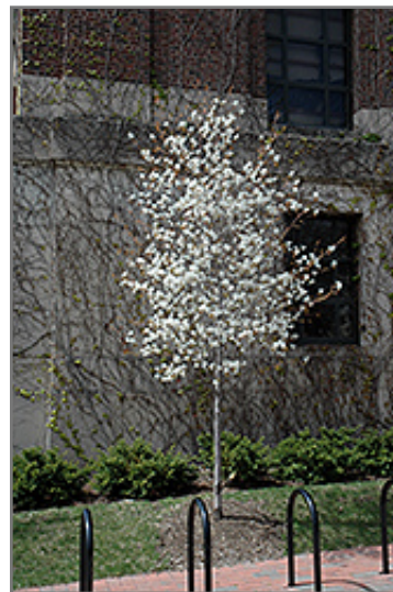
Snowcloud Serviceberry in bloom