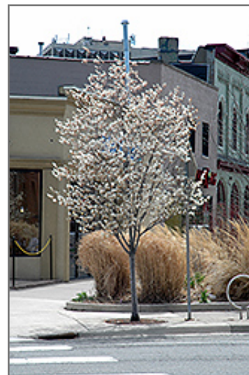
Autumn Brilliance Serviceberry in bloom