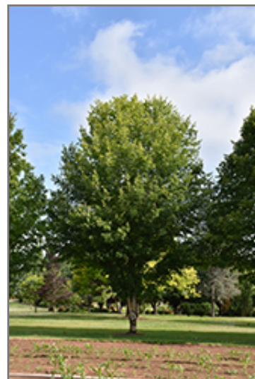
Belle Tower Sugar Maple