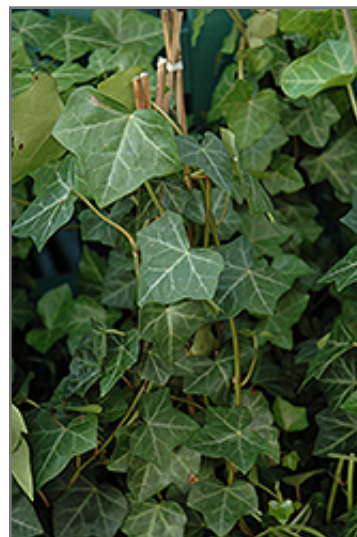
Thorndale Ivy foliage