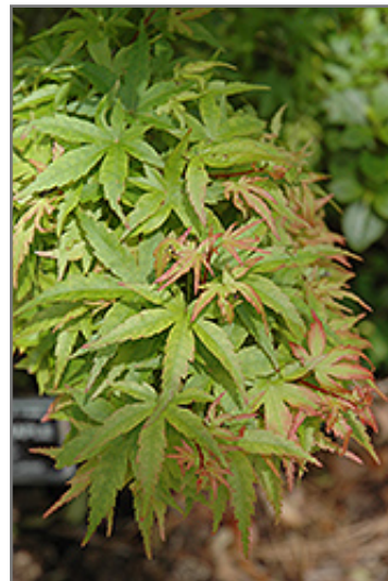
Sharp's Pygmy Japanese Maple foliage