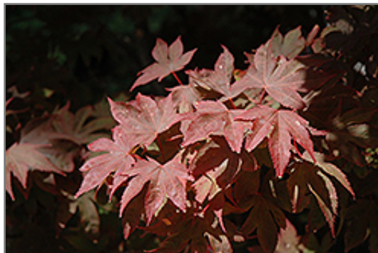
Ruslyn In The Pink Japanese Maple foliage

Ruslyn In The Pink Japanese Maple is recommended for the following landscape applications;