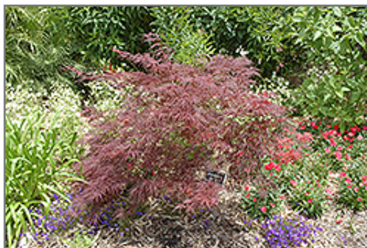
Dissectum Nigrum Cutleaf Japanese Maple