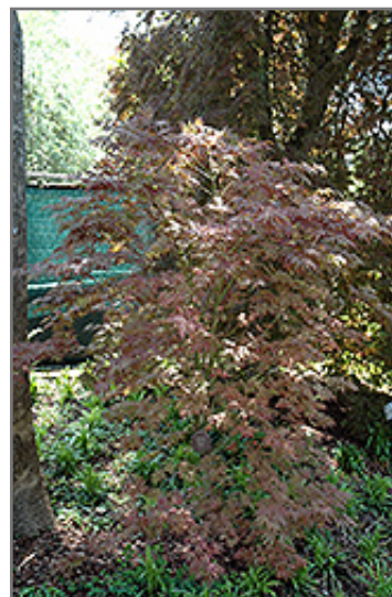
Mikazuki Japanese Maple