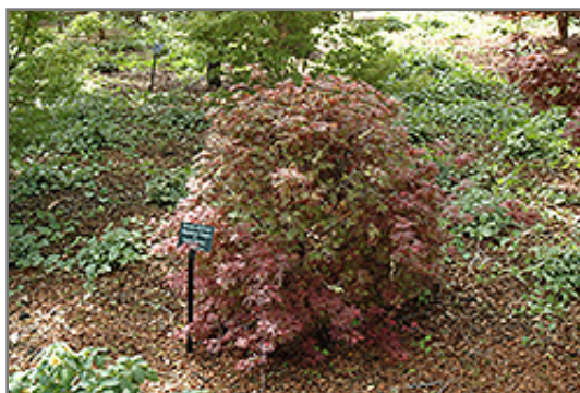
Kandy Kitchen Japanese Maple