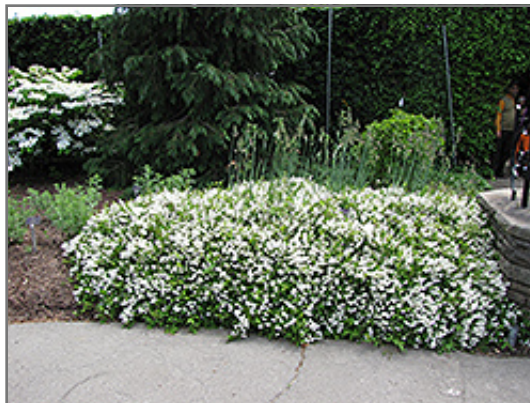
Nikko Deutzia in bloom