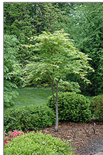
Osakazuki Japanese Maple