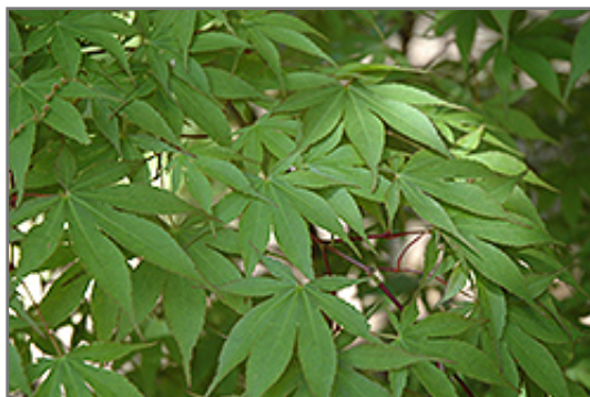
Osakazuki Japanese Maple foliage

Osakazuki Japanese Maple is recommended for the following landscape applications;