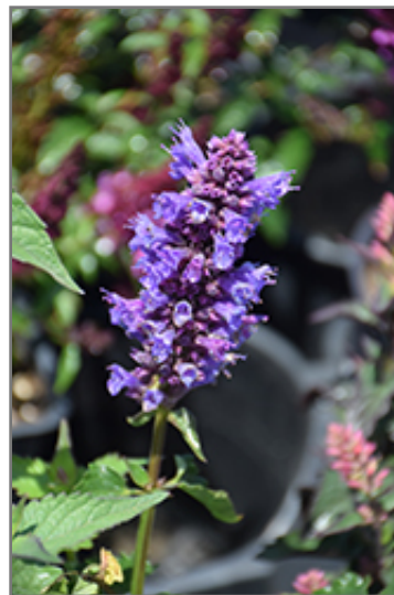
Blue Boa Hyssop flowers