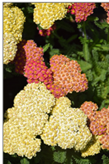
Desert Eve Terracotta Yarrow flowers

Desert Eve Terracotta Yarrow is recommended for the following landscape applications;