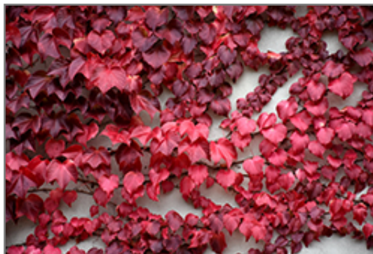
Veitch Boston Ivy in fall