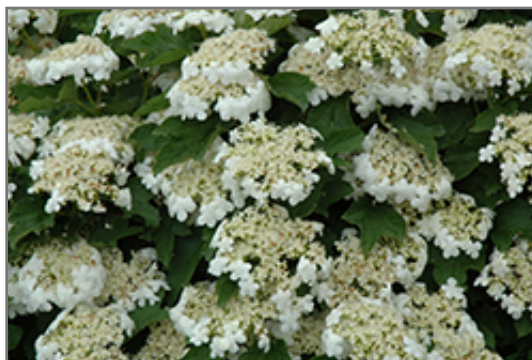
Compact European Cranberry flowers