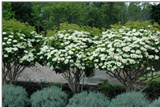
Compact European Cranberry in bloom