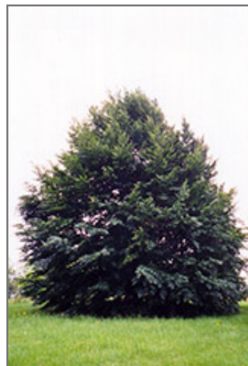
European Beech