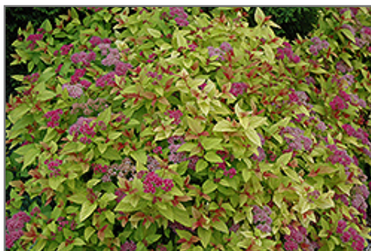
Magic Carpet Spirea flowers