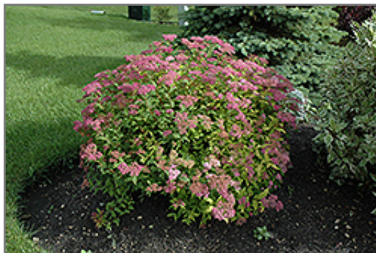
Goldflame Spirea in bloom