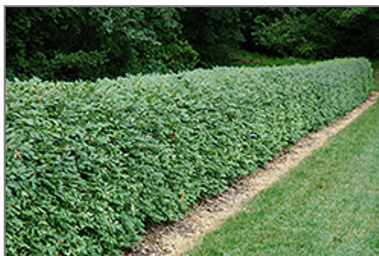
Winged Burning Bush