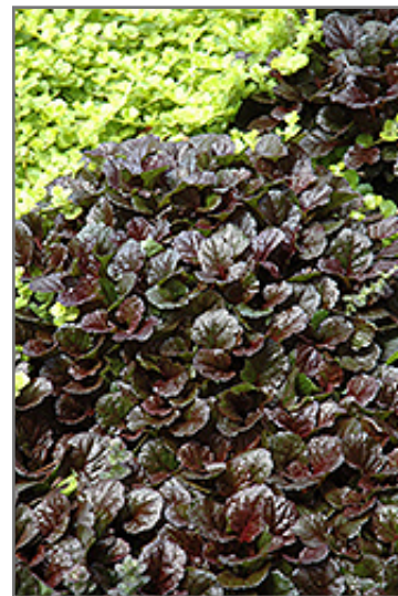
Black Scallop Bugleweed