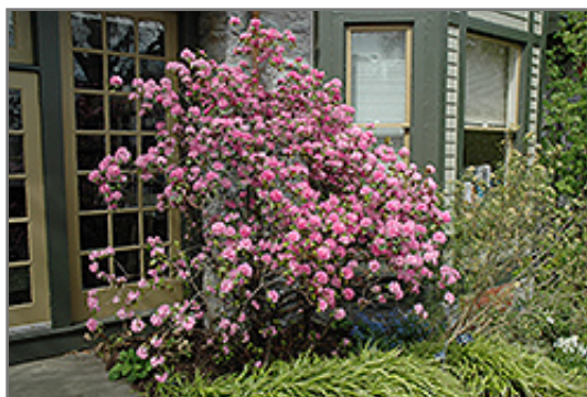
Olga Mezitt Rhododendron in bloom