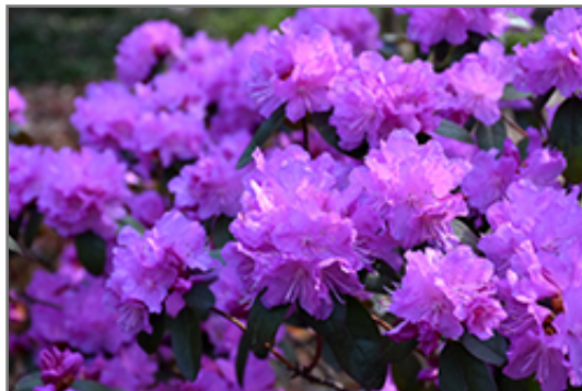
P.J.M. Elite Rhododendron flowers