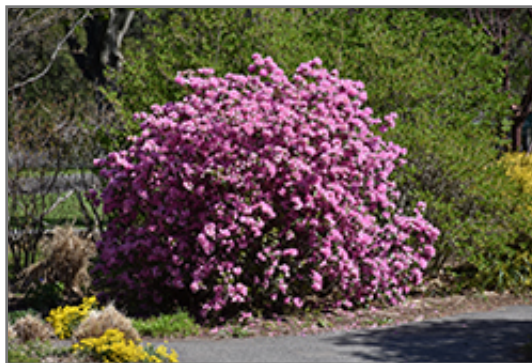
P.J.M. Elite Rhododendron in bloom