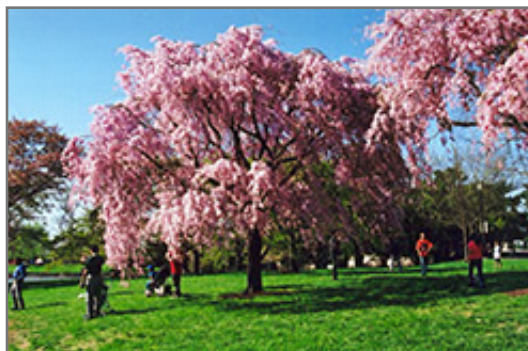
Pink Weeping Higan Cherry in bloom