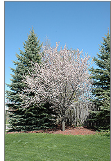
Newport Plum in bloom

This tree should only be grown in full sunlight. It does best in average to evenly moist conditions, but will not tolerate standing water. It is not particular as to soil type or pH. It is highly tolerant of urban pollution and will even thrive in inner city environments. This is a selected variety of a species not originally from North America.