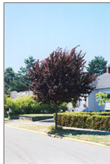
Newport Plum