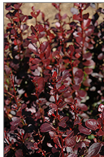
Rosy Rocket Barberry foliage