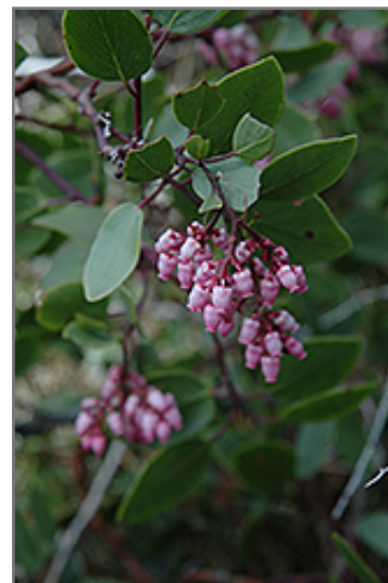
Greenleaf Manzanita flowers