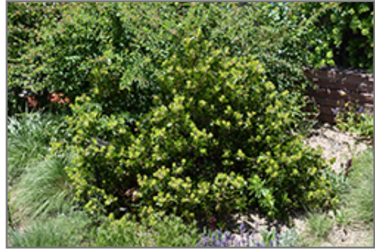
Greenleaf Manzanita

This shrub does best in full sun to partial shade. It is very adaptable to both dry and moist growing conditions, but will not tolerate any standing water. It is very fussy about its soil conditions and must have sandy, acidic soils to ensure success, and is subject to chlorosis (yellowing) of the foliage in alkaline soils, and is able to handle environmental salt. It is somewhat tolerant of urban pollution. This species is native to parts of North America.