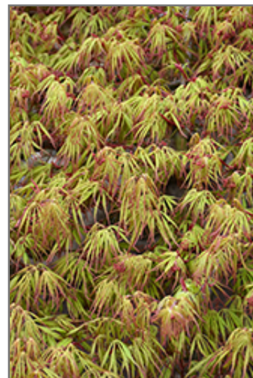
Spring Delight Japanese Maple foliage