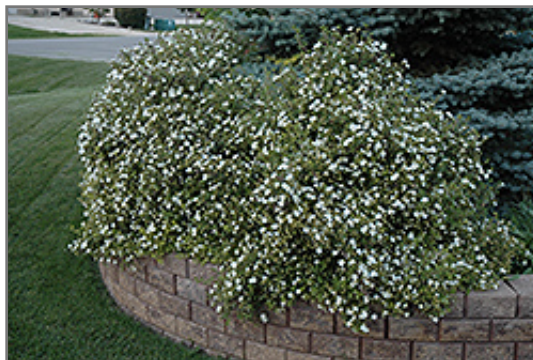
Abbotswood Potentilla in bloom