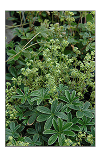
Alpine Lady's Mantle in bloom

Alpine Lady's Mantle features subtle cymes of chartreuse flowers at the ends of the stems from early to mid summer. The flowers are excellent for cutting. Its small deeply cut round leaves remain grayish green in color with distinctive silver edges throughout the season.