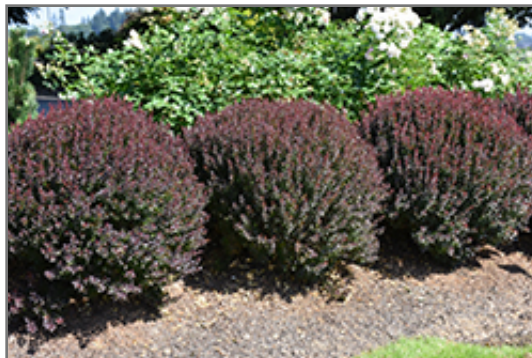
Pygmy Ruby Barberry

Pygmy Ruby Barberry will grow to be about 15 inches tall at maturity, with a spread of 3 feet. It tends to fill out right to the ground and therefore doesn't necessarily require facer plants in front. It grows at a medium rate, and under ideal conditions can be expected to live for approximately 20 years.