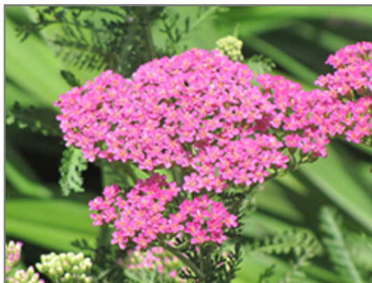
Pretty Belinda Yarrow flowers

Pretty Belinda Yarrow is recommended for the following landscape applications;