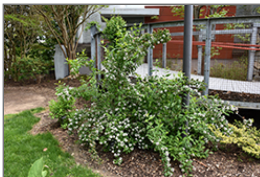
Fragrant Abelia in bloom