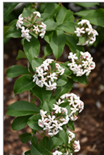
Fragrant Abelia flowers